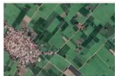
Fig 2. Sample Satellite image